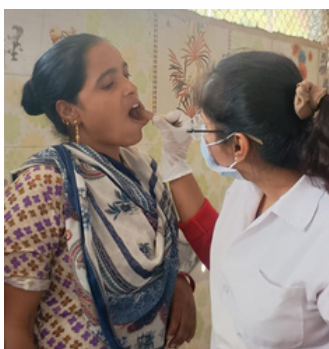
Kokari 2 - 7th February 2024

As part of our ongoing commitment to promoting oral health, St. George Hospital, CST, has been conducting dental health camps across various communities. These camps provide free dental checkups, hygiene awareness sessions, and preventive care, ensuring access to essential healthcare services. With 409 direct beneficiaries, this initiative is making a tangible difference in the lives of community members by fostering better oral hygiene habits and early intervention for dental issues.