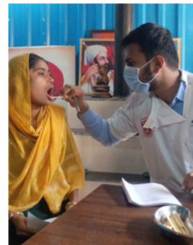
Kamla Nagar 18th February 2025