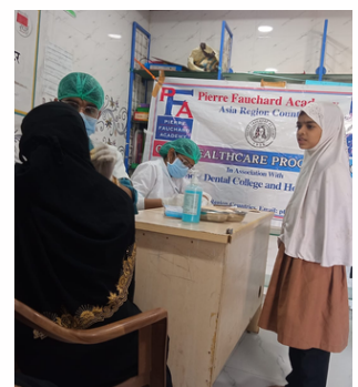
Bhim Nagar, 18th February 2025