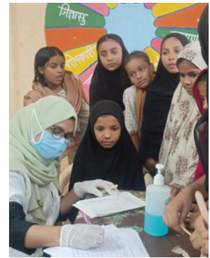
Nardkarni School - 24th & 25th February 2025