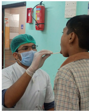
K.D. Gaikwad School - 13th February 2025