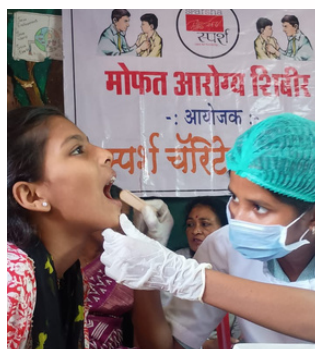
Kokari 1 - 10th February 2025