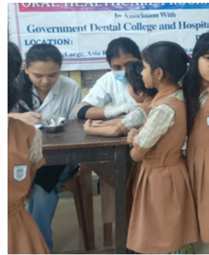
Joglekar Wadi - 20th February 2025